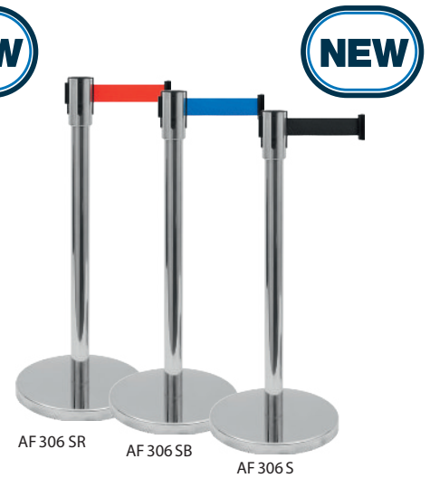
AF 306 SR