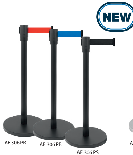
AF 306 PR