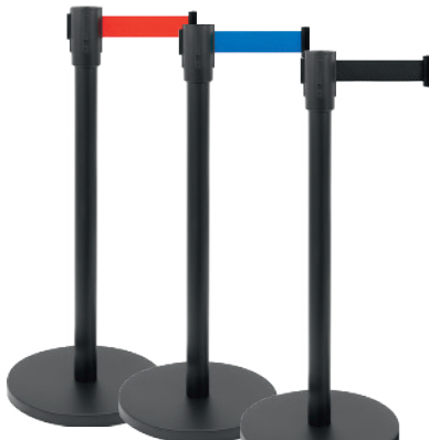
AF 206 PR