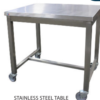
STAINLESS STEEL TABLE with one Level