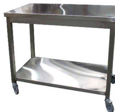
STAINLESS STEEL TABLE with two Levels