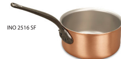
INO 2516 SF