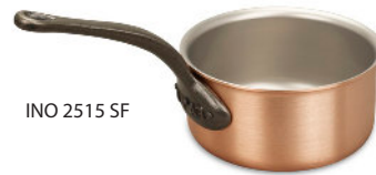
INO 2515 SF