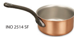
INO 2514 SF