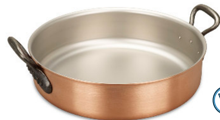
INO 2549 SF