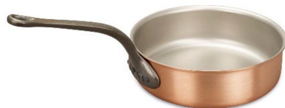
INO 2561 SF