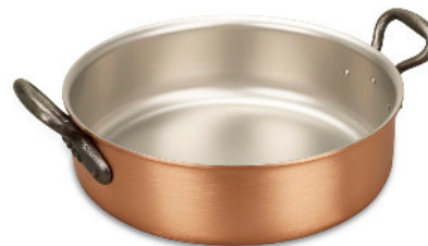
INO 2548 SF