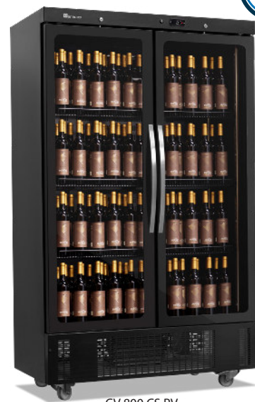
CV 800 CS PV